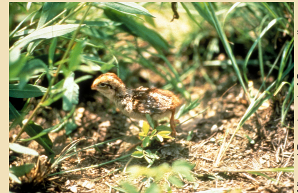
Missouri Department of Conservation